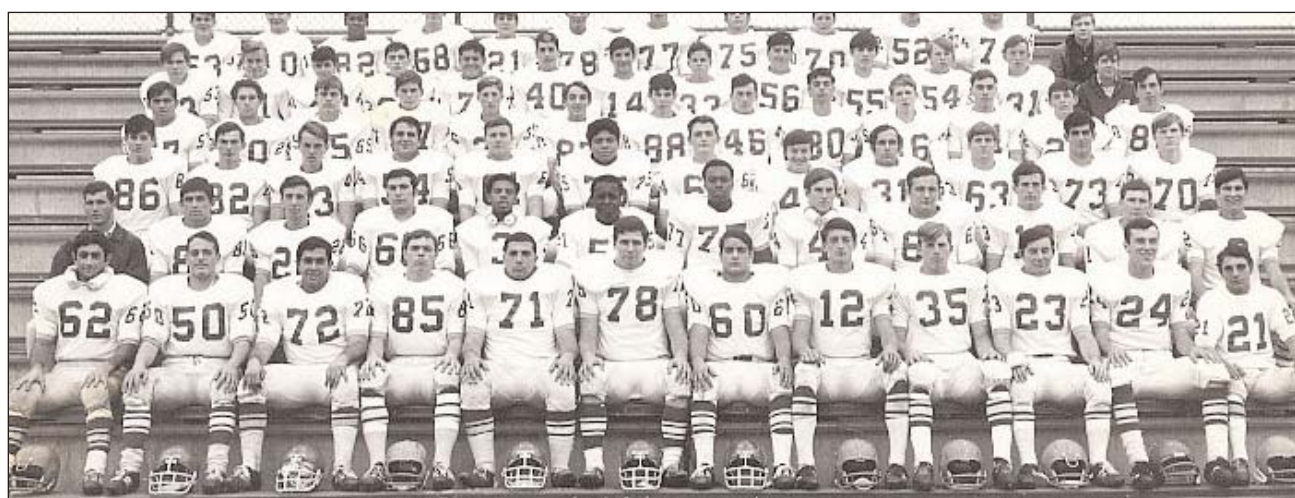
The undefeated 1968 West Haven High football team was voted No. 1 in the New Haven Register poll with a 9-0 record. The National Sports News Service ranked West Haven fifth in the country.