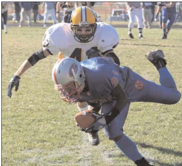
Simsbury Gridiron Club